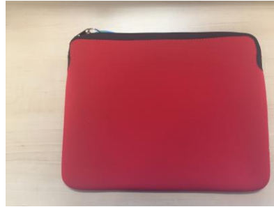
Sample homework pouch: