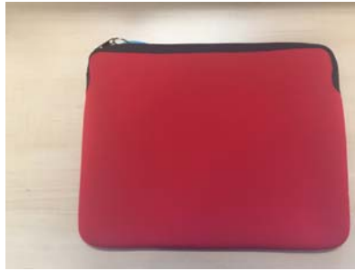
Sample homework pouch: